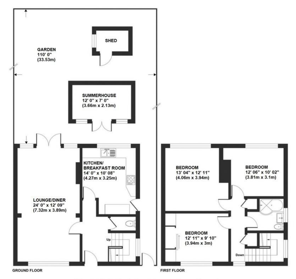
This plan is for illustration purpose only - not to scale